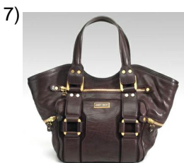
the bag, purse