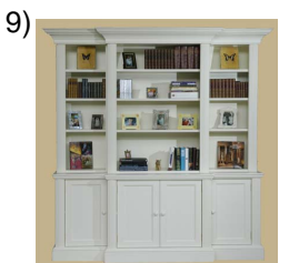
bookcase or shelves