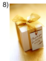
thank you very much