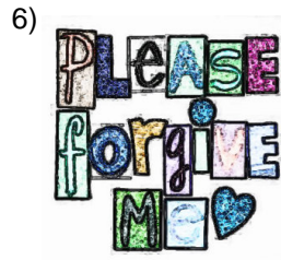
forgive me, excuse me