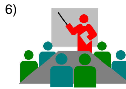
meeting, get together