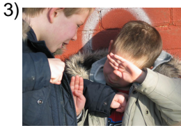
to bother, to bug