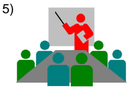
meeting, get together