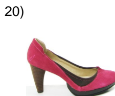
some short heeled shoes