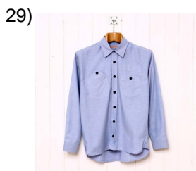
formal dress shirt