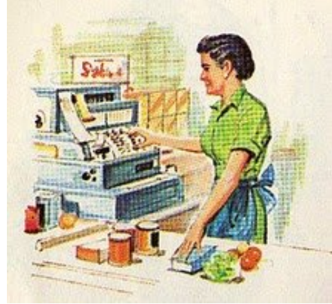
teller or cashier