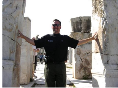
between, divided by