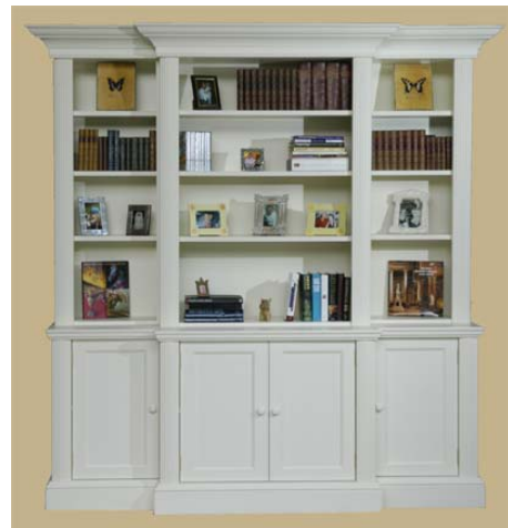
bookcase or shelves