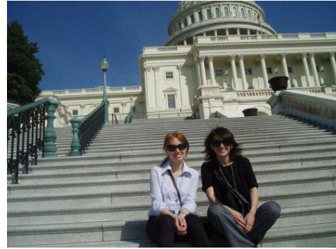
in front of