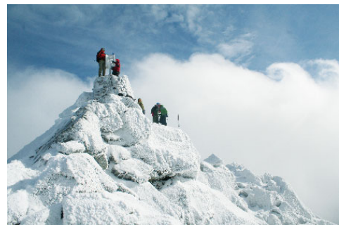
on top of