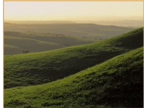
large hill, foot hills