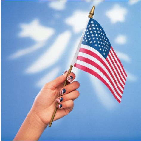
Fourth of July