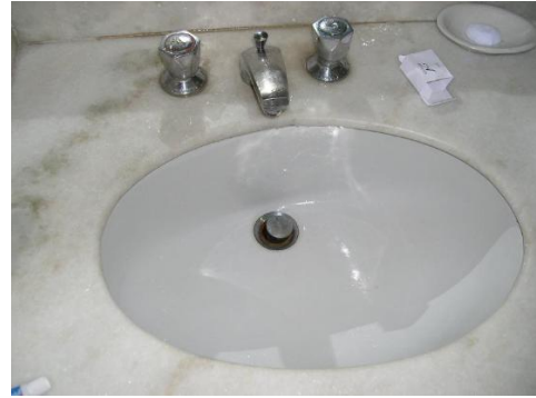
sink or washbasin