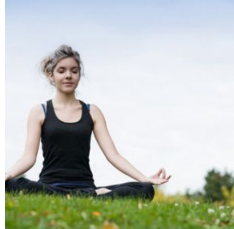
I feel very good