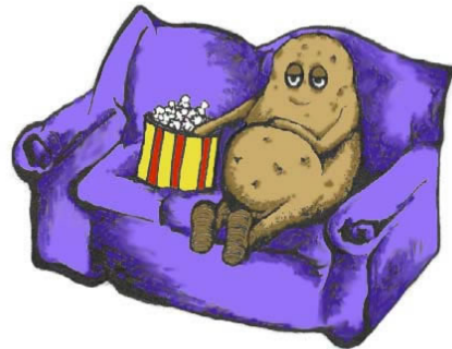
lazy, lazy person