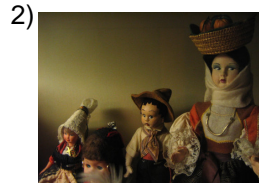
big doll, beautiful woman