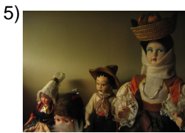
big doll, beautiful woman