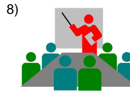
meeting, get together