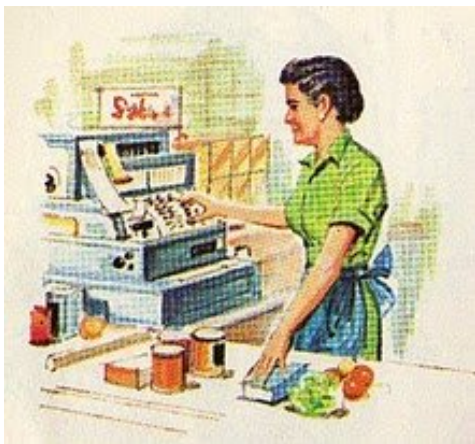
teller or cashier