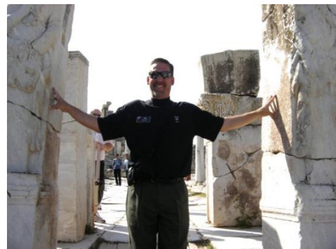
between, divided by