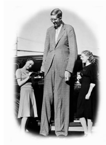
tall (masculine singular)