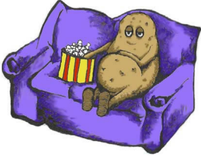
lazy, lazy person