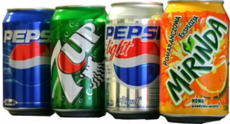
refreshments, soft drink