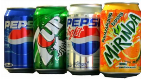
refreshments, soft drink