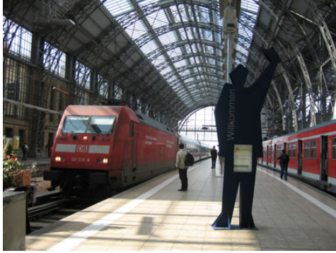
bus or train station